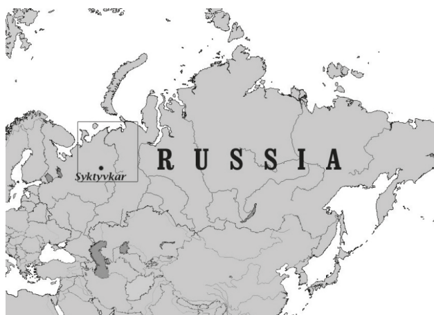
Figure 1. Study site – the Komi Republic and the Nenets Autonomous District where migrating Long-tailed Ducks were observed.

This study is based on our own published [2-4; 17-19] and unpublished data, as well as other literature sources. Field material on the migrations of Long-tailed Ducks was collected in the Nenets Autonomous District of the Arkhangelskaya Region (from the Kaninskij Peninsula in the west to the Yugorsky Peninsula in the east) and in the Komi Republic (Figure 1) in May-October from 1973 to 2022. Long-tailed duck movements were observed stationary during targeted waterfowl surveys, as well as on pedestrian and boating routes.