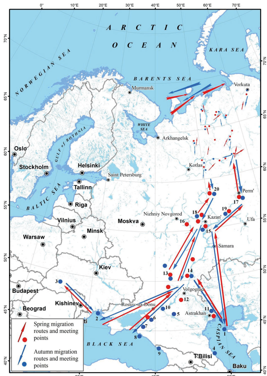
Figure 3. Migration routes and wintering sites of the Long-tailed Duck on the European part of Russia. Рисунок 3. Пути пролета и места зимовок морянки на европейском Северо-Востоке России

Long-tailed ducks are periodically found in the upper Dniester valley. The species' earliest records date back to March 1879 and January 1914. From 1993 to 1998, single birds and pairs of female Long-tailed Ducks were recorded annually from November to March at a reservoir near Burshtyn town